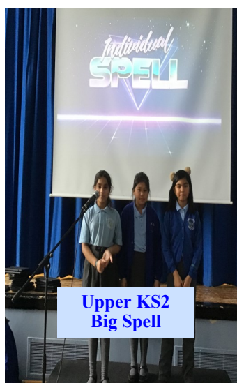
Upper KS2 Big Spell