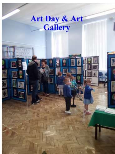
Art Day & Art Gallery