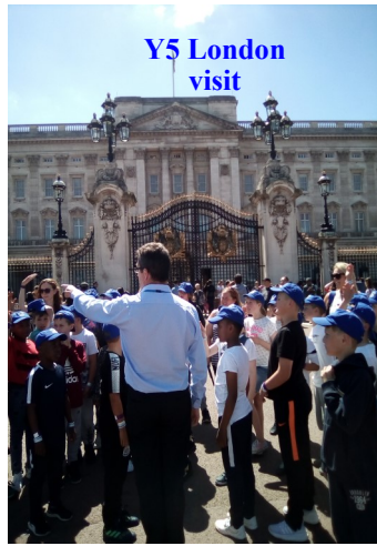
Y5 London visit