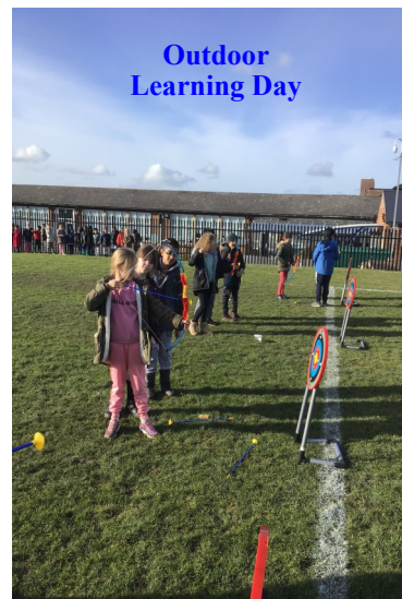
Outdoor Learning Day