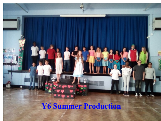
Y6 Summer Production