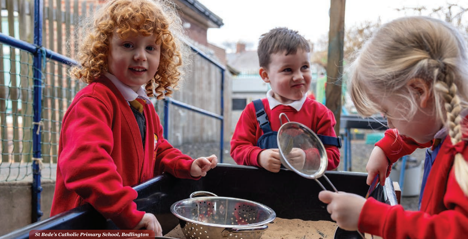
St Bede's Catholic Primary School, Bedlington