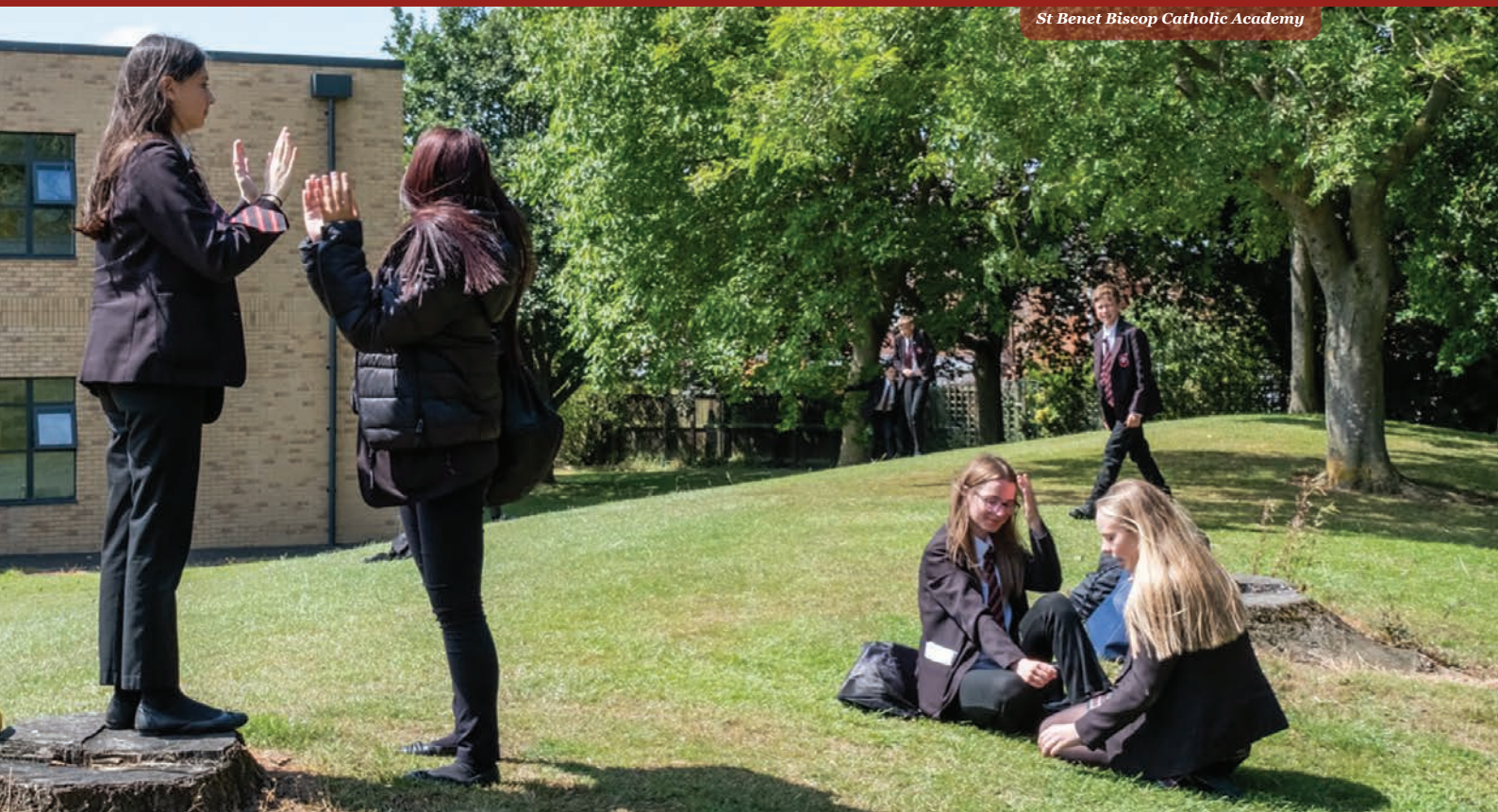
St Benet Biscop Catholic Academy

Sacred Heart Catholic High School Fenham Hall Drive, Fenham, Newcastle upon Tyne. NE4 9YH (0191) 816 3700 • enquiries@bishopbewickcet.org