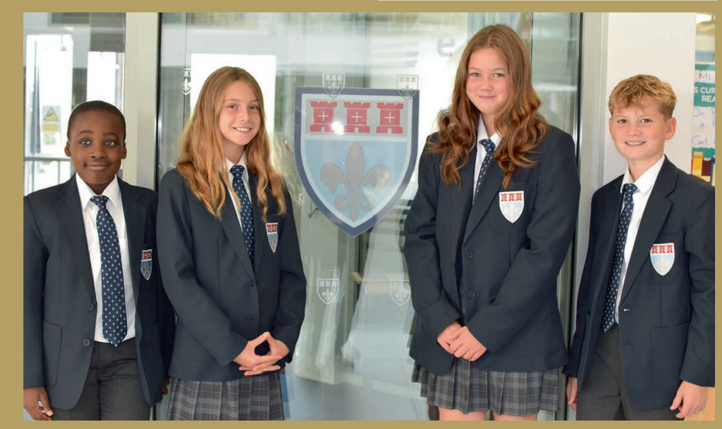
Many congratulations to all students, staff, parents, carers and governors at St Mary's.

The inspectors noted that, 'St Mary's is an ambitious and nurturing school where pupils thrive. They are taught how to live out the school's Christian values in everything they do. This includes a continual focus on the importance of positive relationships, gratitude and service of others. Pupils are happy and safe in this exceptionally supportive atmosphere, where leaders ensure that pupils benefit from a high-quality and expansive curriculum.'